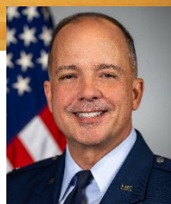
Col. Don Schofield Commander/Conductor United States Air Force Band